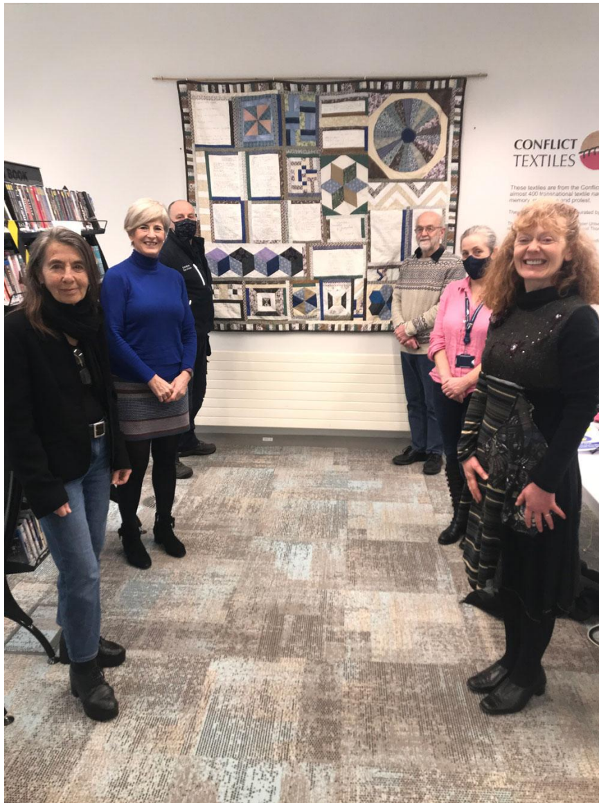
Conflict Textiles Team and Magee Campus Library and Estates staff pictured at the installation of the quilt.