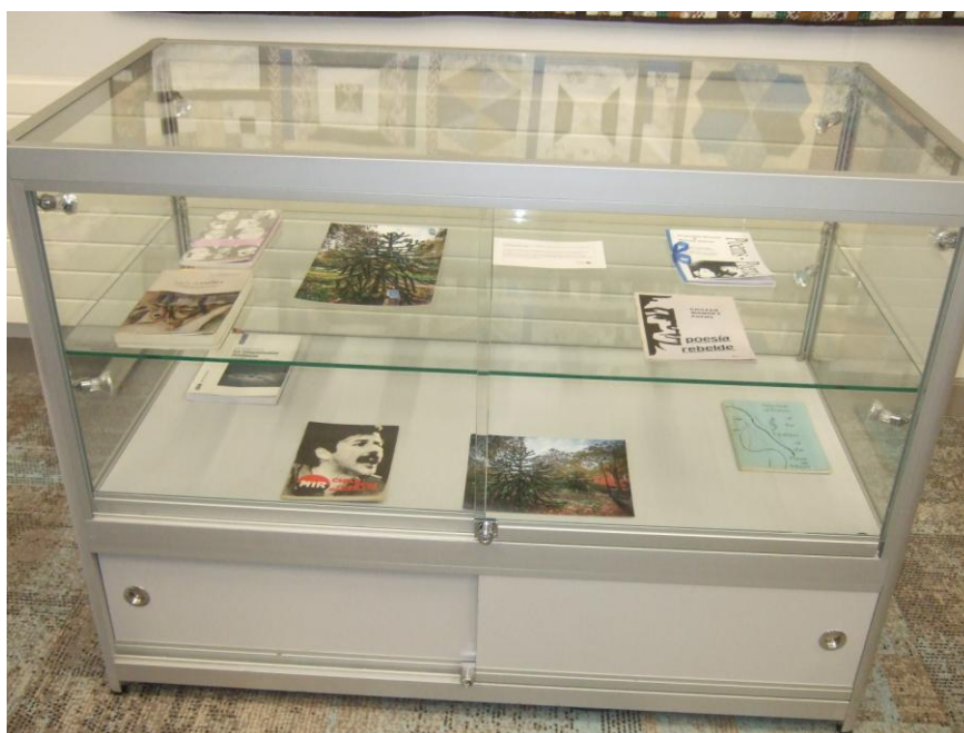
The completed memorabilia display.